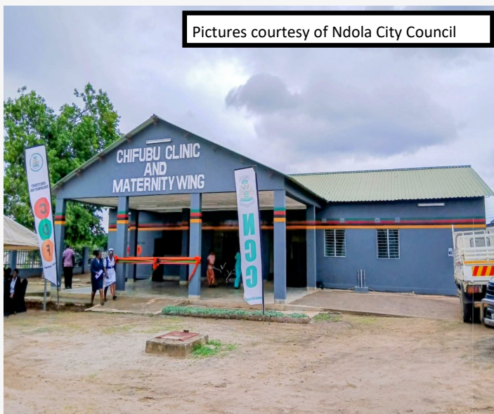
The newly constructed Mutambala Clinic and maternity annex