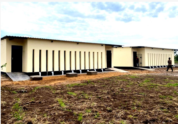
Ablution block handed over to Chishinga Secondary School