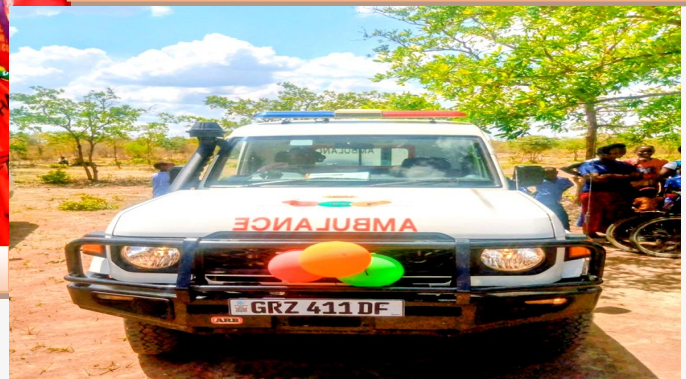
The newly procured ambulance