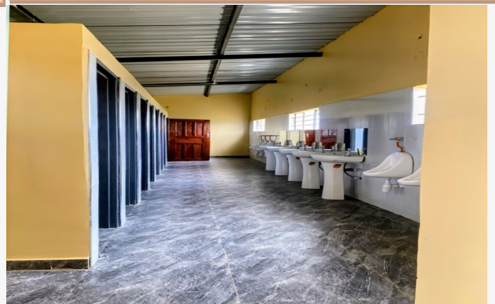
Inside the Ablution Block

The Council Chairperson therefore, encouraged learn-