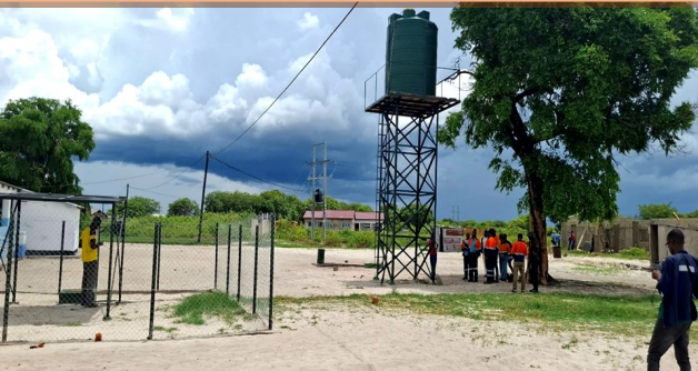
Inspection of a water tank procured using CDF