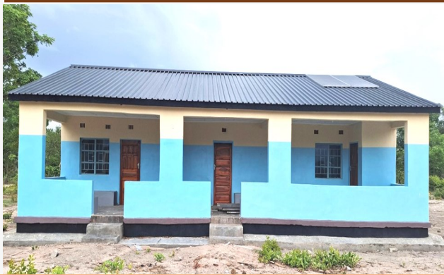
A housing block built through CDF