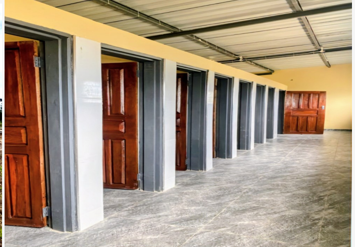
Ntulo School Ablution Block