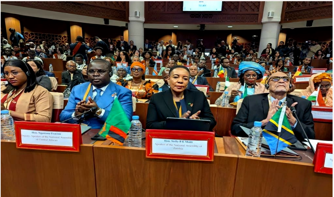
Speaker of the National Assembly of Zambia, Rt. Hon. Nelly B.K Mutti, SC, MP, FAPRA (2 nd right) at the opening Session of the African Forum of the Children's Parliament in Rabat, Morocco.