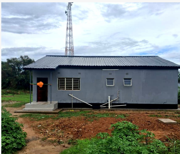
A newly constructed maternity annex

The event was also attended by representatives from the Council office, Ward Development Committees (WDCs) and local stakeholders.