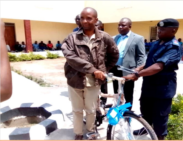
One of the beneficiaries receive a bicycle after the handover ceremony