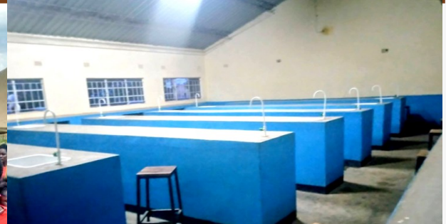
The newly commissioned 1x2 laboratory