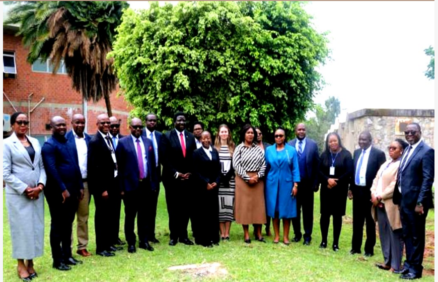
Deputy Clerk Corporate Affairs (7 th left) Deputy Clerk—Corporate Affairs poses with Members of Parliament and Parliamentary staff following the official opening of the capacity-building training on Post-Legislative Scrutiny.

She also acknowledged the prospective Memo-