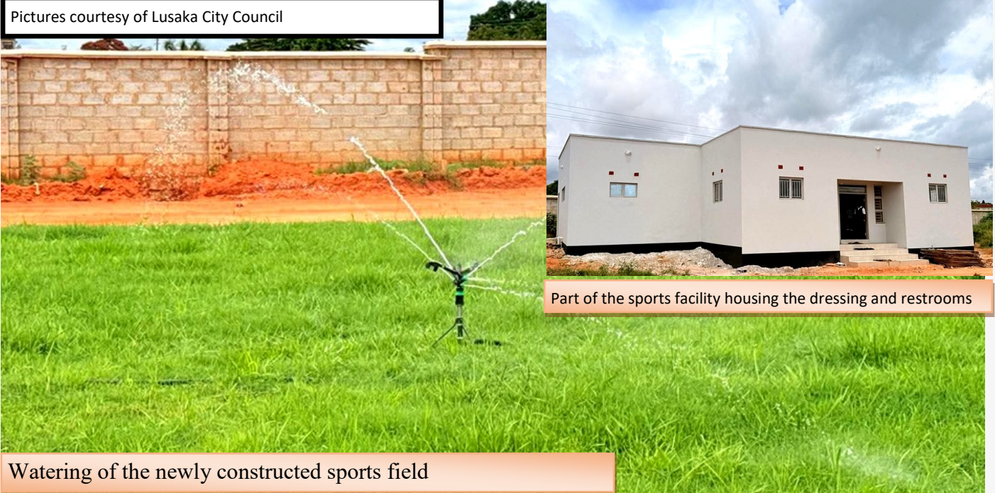
Watering of the newly constructed sports field