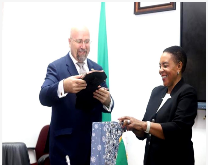
Speaker Mutti sharing a light moment with Ambassador Kyrián.

The meeting also explored potential collaboration between the Czech Republic and Zambia's Parliamentary Caucus on Food Security and Nutrition, in line with the country's development cooperation framework and focus on nutrition.