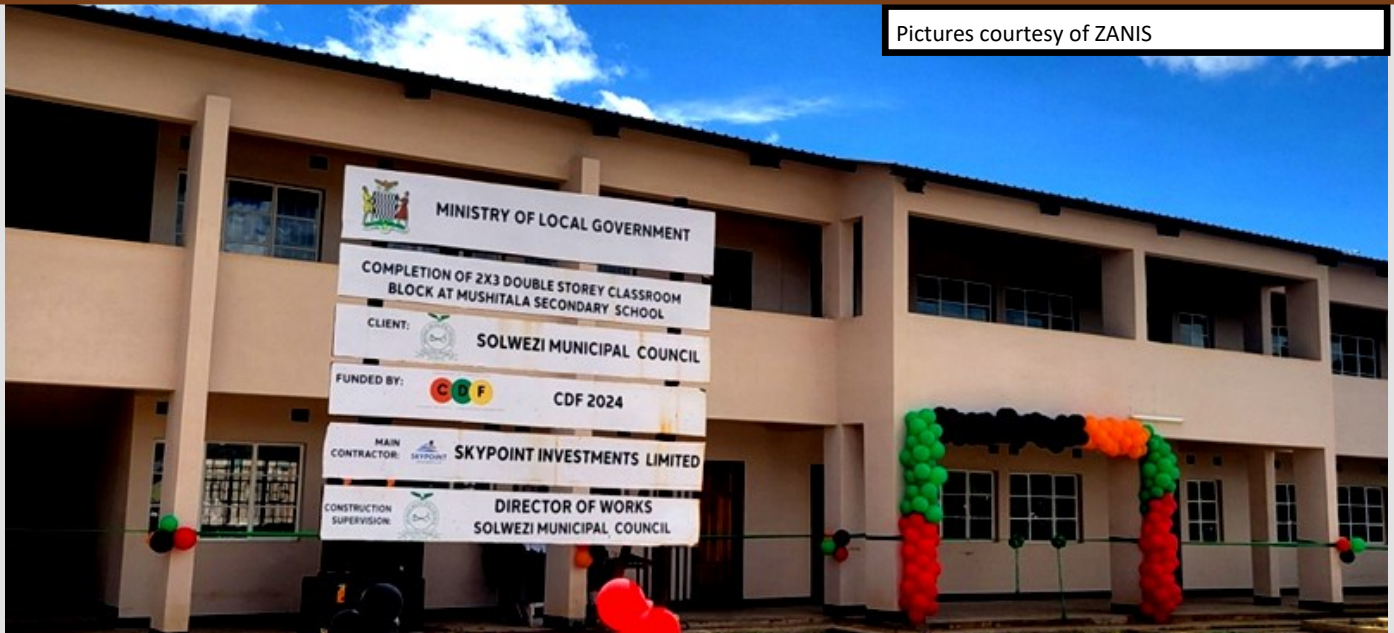
The Newly constructed one-by-six double-storey classroom block at Mushitala Secondary School in solwezi District.