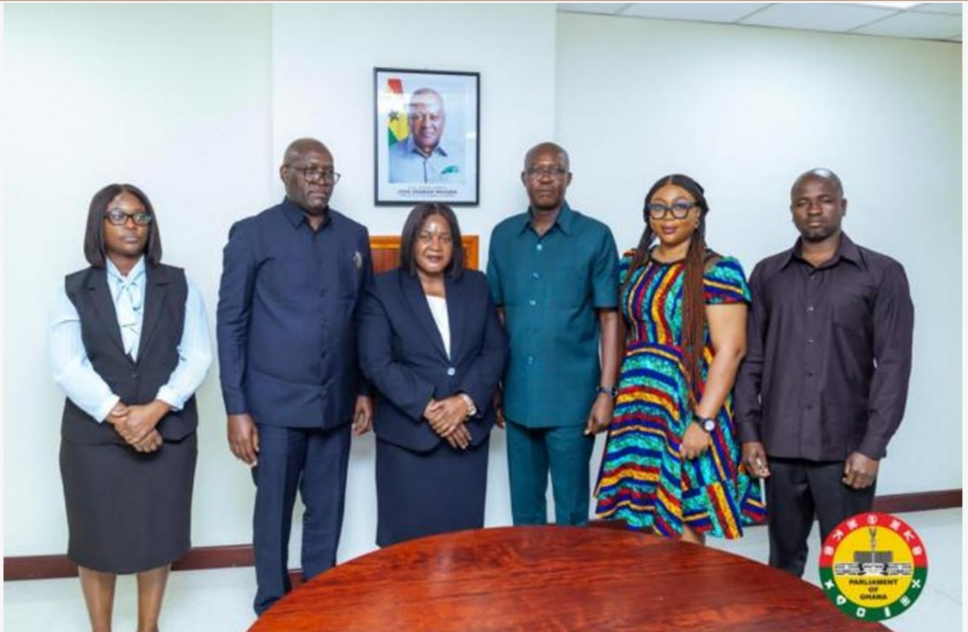
Hon. Chisangano poses for a group photo with her counterpart, Hon. Bernard Ahiafor, First Deputy Speaker of the Parliament of Ghana, alongside staff from the National Assembly of Zambia and the Parliament of Ghana during her visit to Ghana.