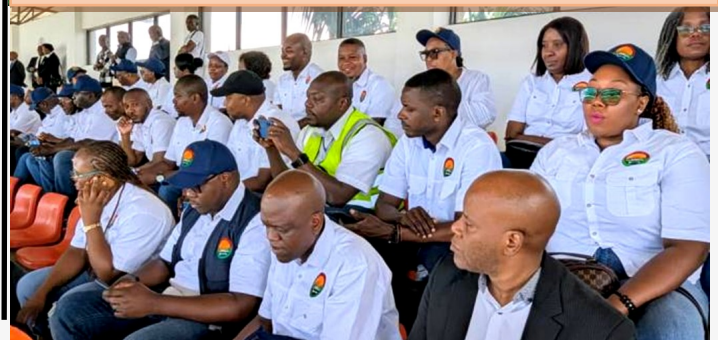
Staff of the National Assembly of Zambia observe fellow participants during the march past after taking their seats at the International Women's Day celebrations.