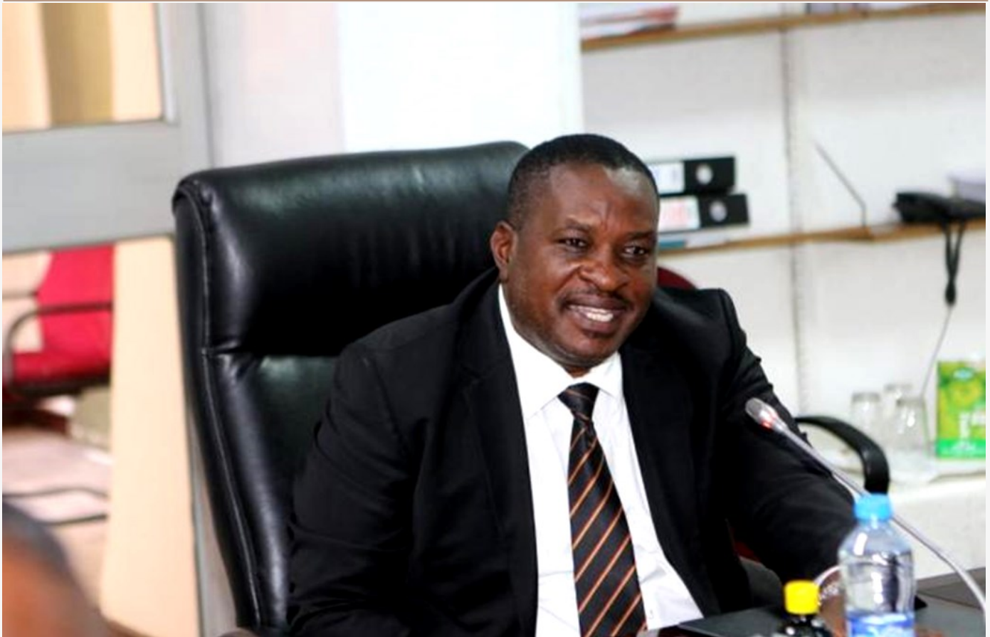
Second Deputy Speaker of the National Assembly of Zambia, Hon. Moses Moyo during the courtesy call with WASH Forum.