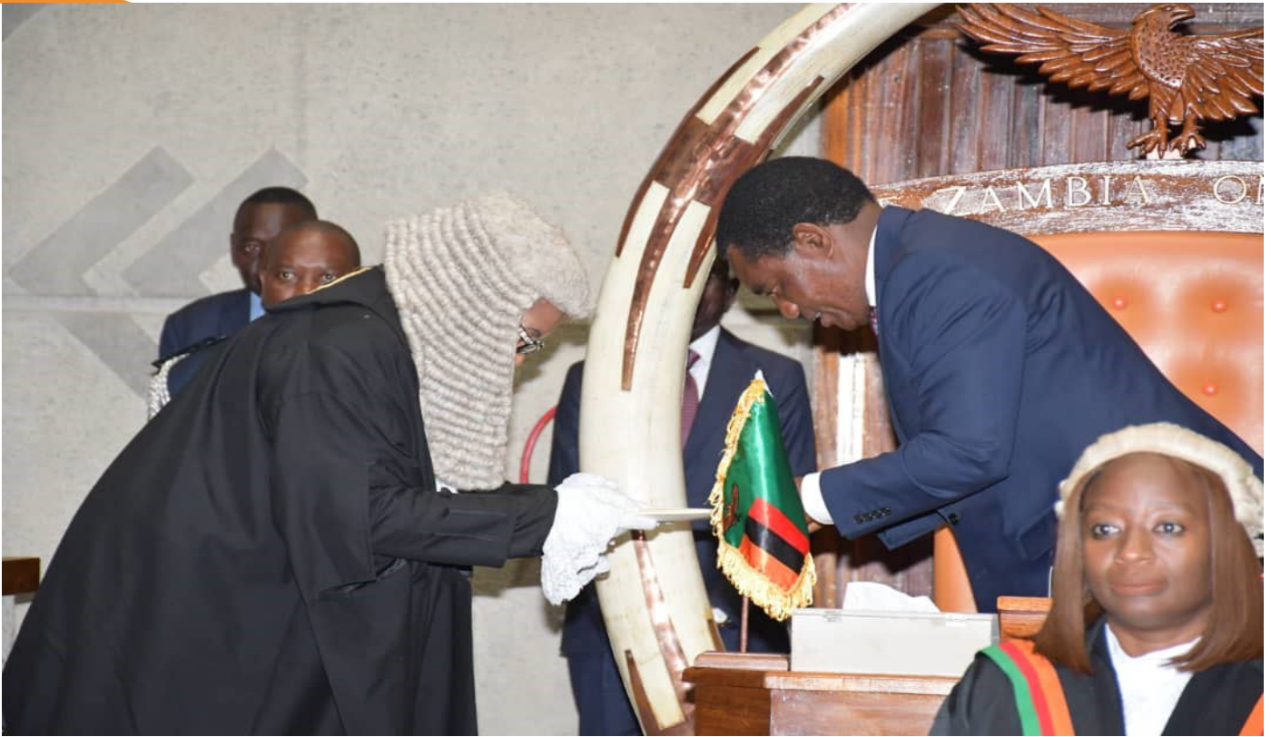
President Hakainde Hichilema handing over the speech on National Values and Principles to the Speaker of the National Assembly, Hon. Nelly B.K Mutti, SC, MP, FAPRA.