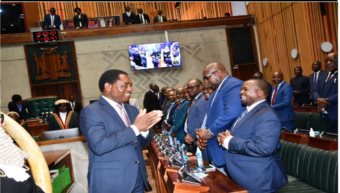
President Hichilema having a light moment with Leader of the Opposition, Hon. Robert Chabinga.