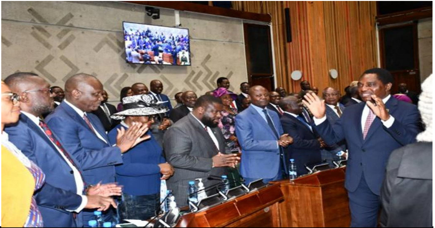
President Hakainde Hichilema greets Members of Parliament from the ruling party after the State of the Nation Address, on Friday, 15th March, 2024.