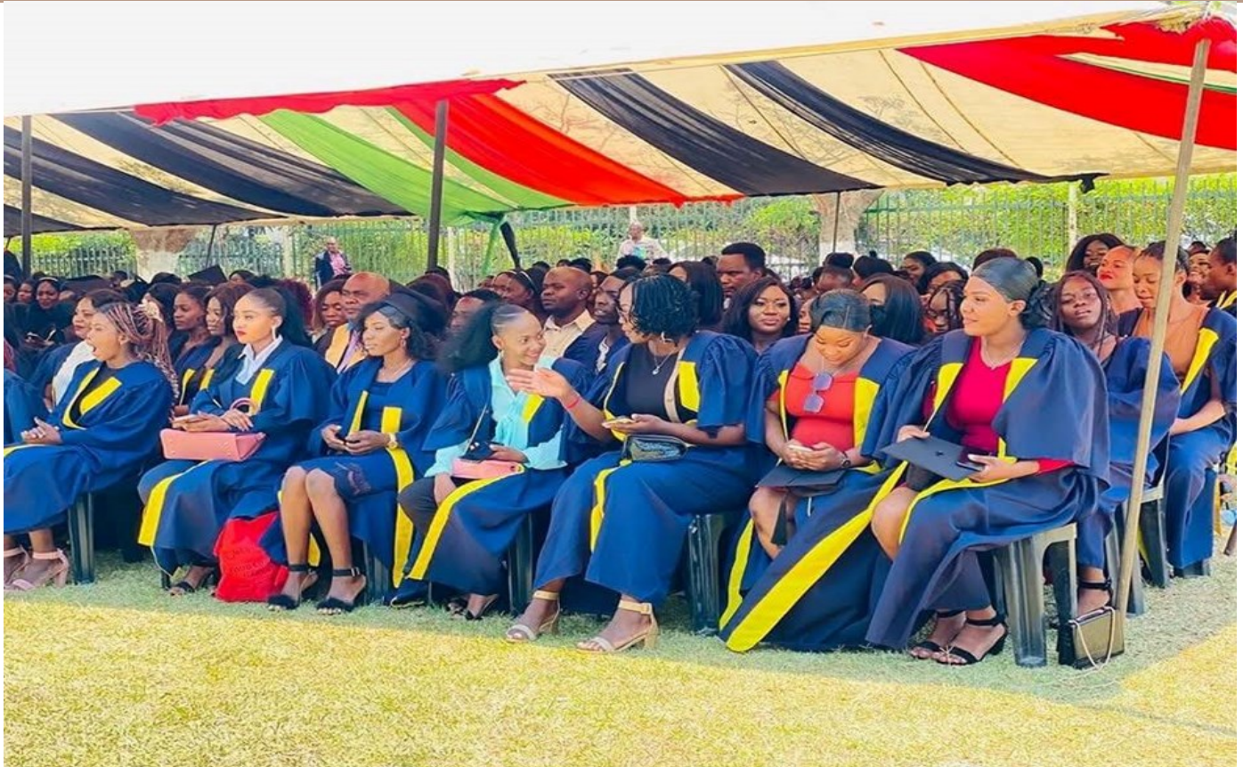
Youth beneficiaries of the 2022 CDF Skills Sponsorship Programme pictured during their graduation ceremony.