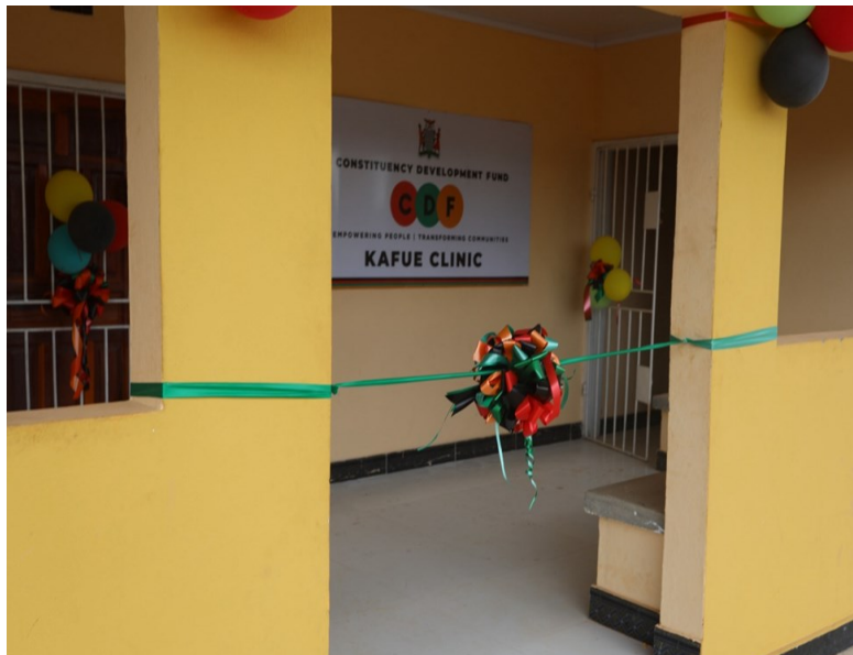
A newly constructed Standard Health Post at Kafue Park Clinic in Kitwe