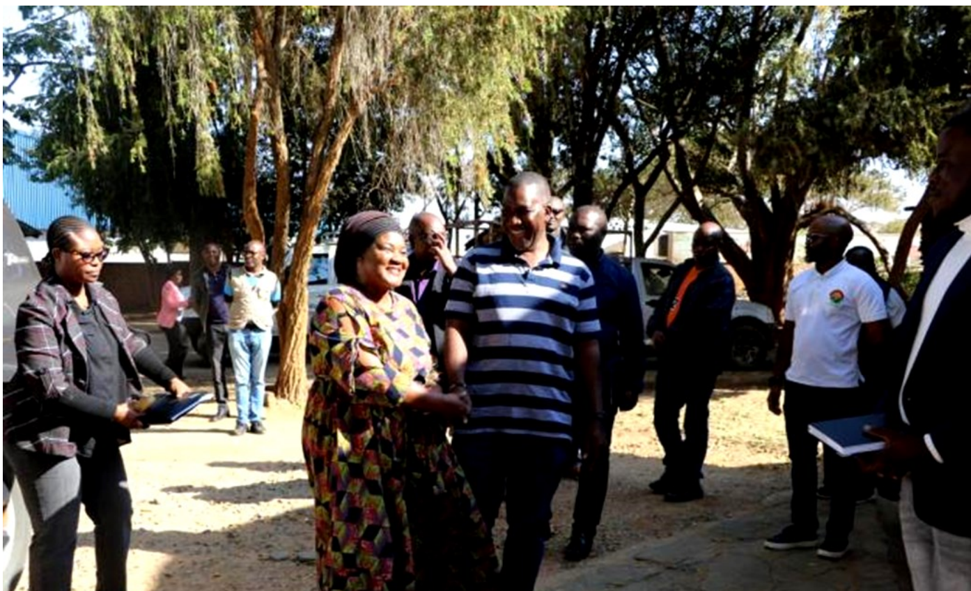
First Deputy Speaker, Hon. Chisangano is received by Provincial Minister of Southern Province and Mumbwa Central Member of Parliament, Hon. Credo Nanjuwa, during her visit to Mumbwa.

The tour covered 12 Constituencies across Central Province namely Bwacha, Kabwe Central, Mkushi North, Serenje, Lufubu, Kapiri Mposhi, Muchinga, Chitambo, Nangoma, Mumbwa, Itezhi-Tezhi, and Mwembeshi.