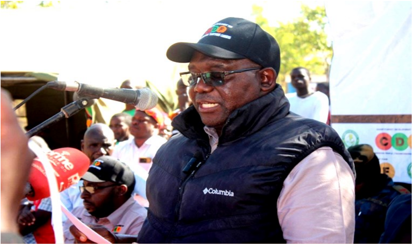
Eastern Provincial minister, Hon. Peter Simon Phiri giving a speech during the handover ceremony of CDF projects and funds