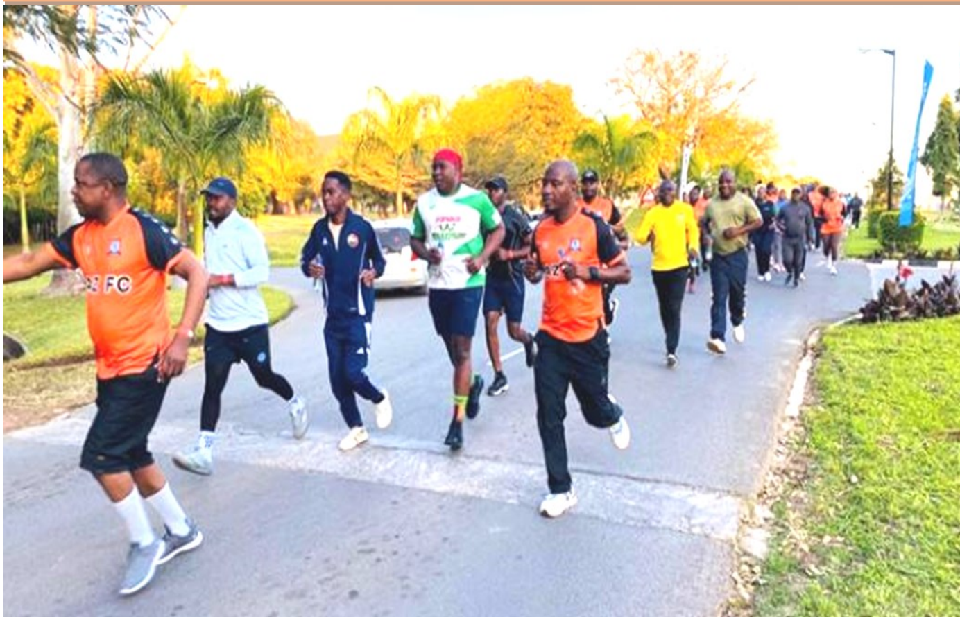
Members of Parliament, staff of the National Assembly, Stakeholders and the public take off from the National Assembly precincts during the fundraising Aerobics Mania event.

By Gwennie Shamizhinga & Namasiku Mubiana