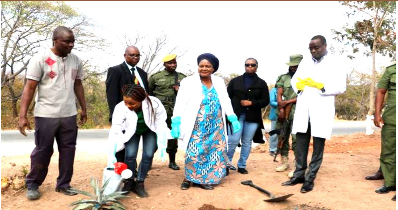
First Deputy Speaker, Hon. Malungo Chisangano, MP, leads a tree planting exercise in Itezhi Tezhi, joined by Hon. Twaambo Mutinta, MP and staff of the National Assembly.