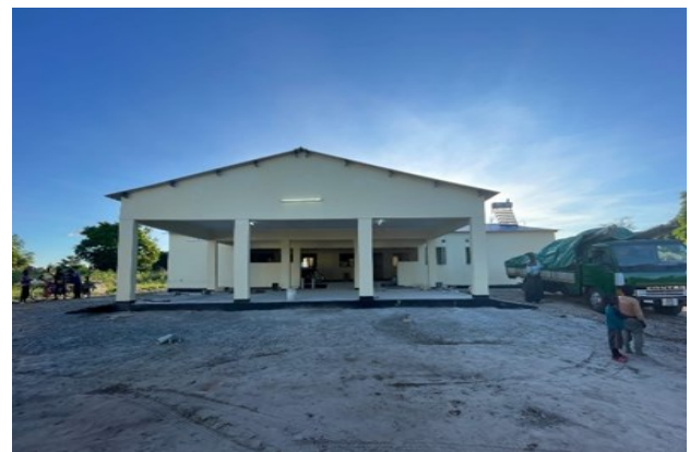
Mabo Kunda Maternity Annex