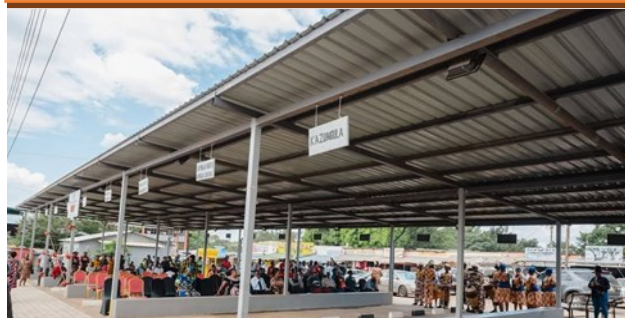
A newly constructed Taxi rank in Akapelwa Ward constructed under Constituency Development Fund.