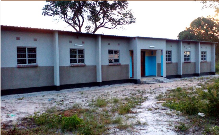
The newly constructed boarding dormitory at Nangula Secondary School.