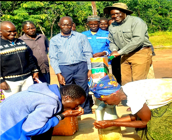
Residents of Shukwe Ward drinking water from one of the newly commissioned boreholes