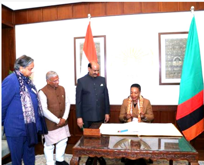
Speaker Mutti signing the visitors book.

The 28 th CSPOC conference was hosted by the Parliament of India in New Delhi, India, from 14 th to 16 th January 2026.