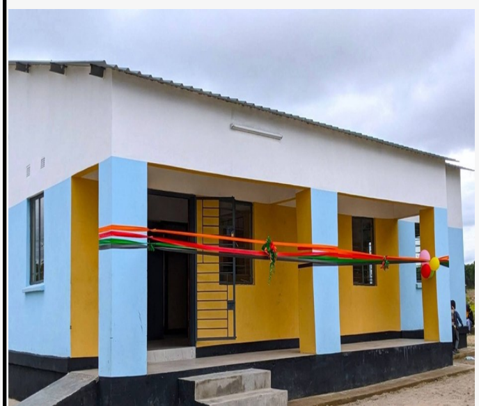
The newly commissioned Soweto Clinic in Kapiri Mposhi Constituency .

The lawmaker called on community members and health workers to take responsibility for safeguarding the clinic. He said proper maintenance will