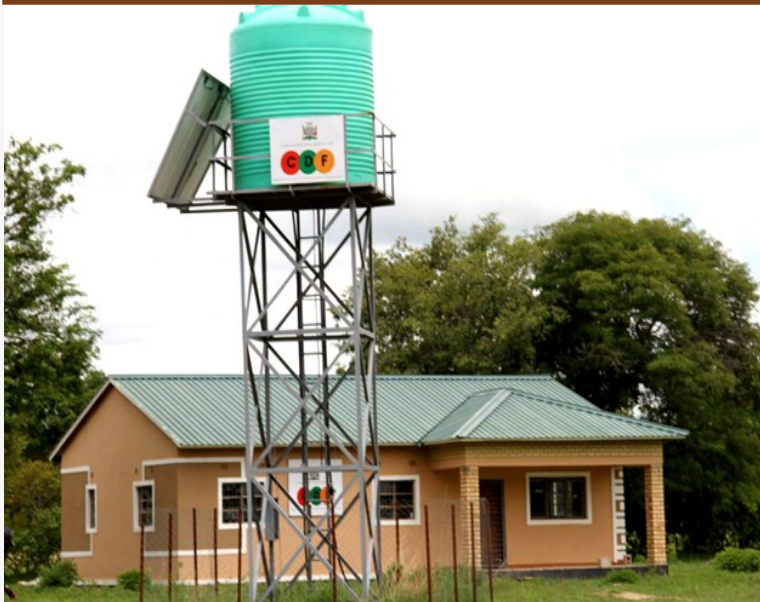
CDF projects commissioned across different wards in Bweengwa Constituency.