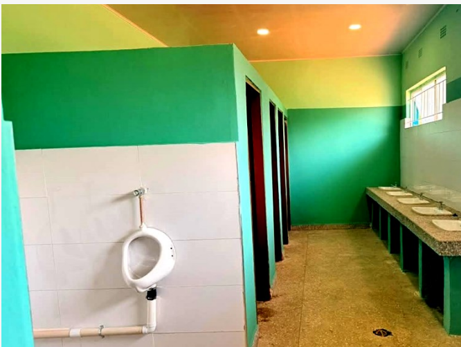
The interior of the newly constructed ablution block at Chainda Community School.