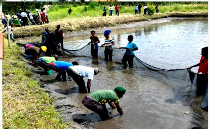
Kayembe Multi-Purpose Cooperative members harvesting fish from their fishpond.

He stated that the cooperative has since expanded its activities to include chicken rearing and maize farming to strengthen household incomes.