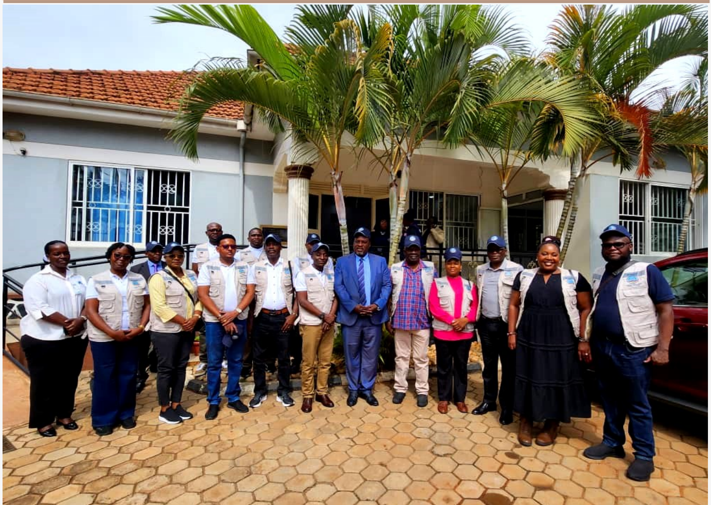
Second Deputy Speaker of the National Assembly of Zambia, Hon. Moses F. Moyo, MP (In Blue suit), poses for a photo with a delegation from the FP-ICGLR Electoral Observation Mission.