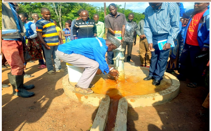
A Resident of Shukwe Ward drinking water from one of the newly commissioned boreholes