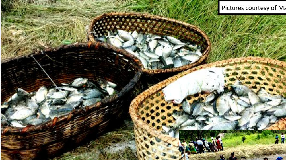
Some of the harvested fish from the Kayembe Multi-Purpose Cooperative fishpond.