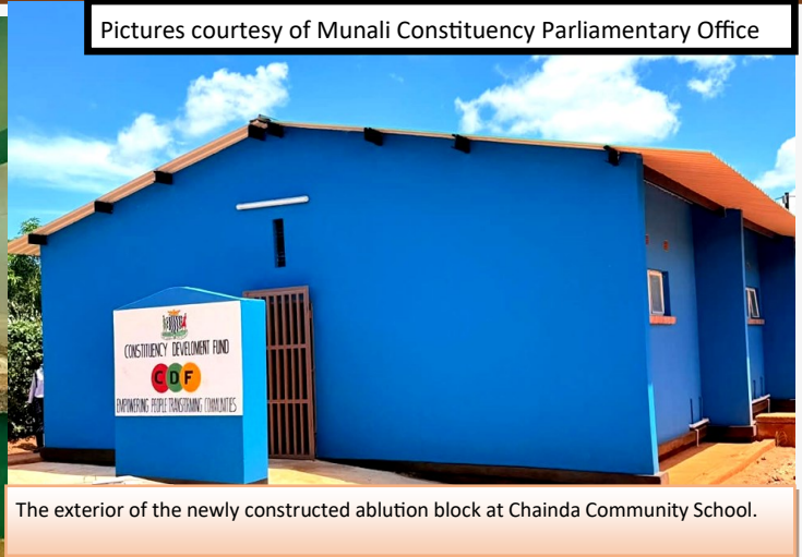
The exterior of the newly constructed ablution block at Chainda Community School.