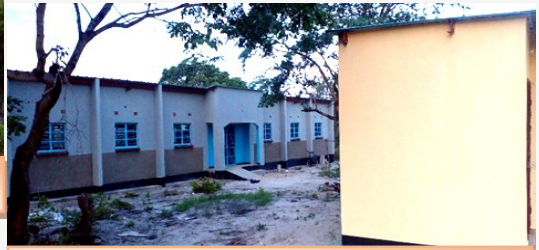
The new dormitory facility and ablution block