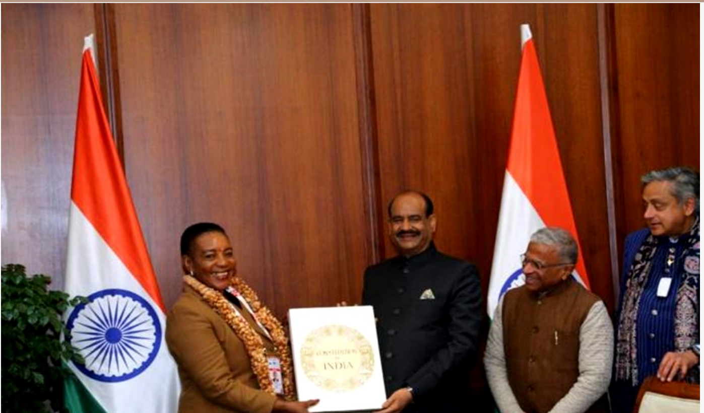
Speaker of the National Assembly of Zambia, Rt. Hon. Dr. Nelly B.K Mutti, SC, MP, FAPRA and Speaker of the Indian Parliament, Mr. Shri Om Birla, after signing the Visitors book.