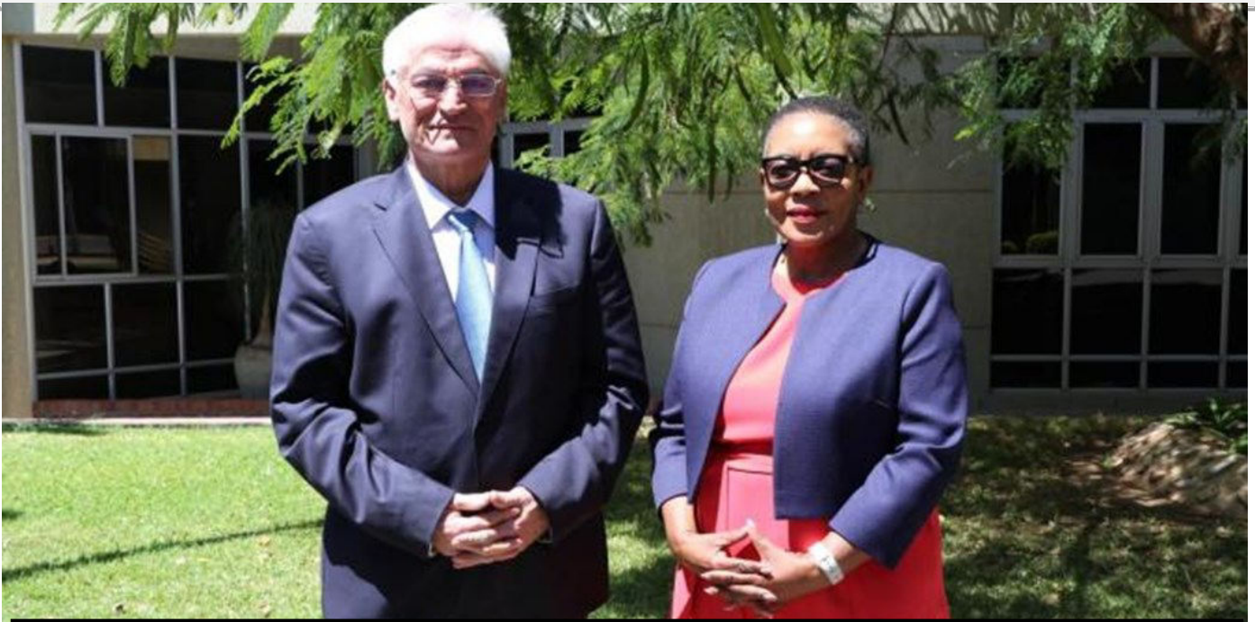
Speaker of the National Assembly Hon. Nelly Mutti pose for a photograph with the Russian Ambassador to Zambia, His Excellency, Mr Azim Yarakhmedo at Parliament Buildings.