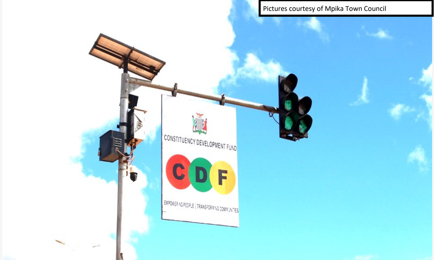
The newly installed solar-powered traffic lights in Mpika District.