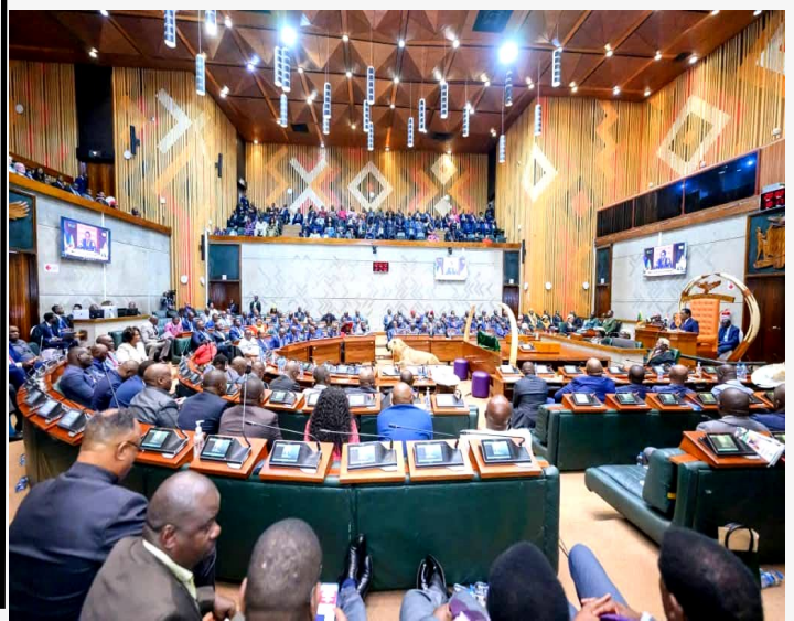
A view of the interior of the National Assembly Chamber, with Members of Parliament and invited guests seated in the Public Galleries, as President Hakainde Hichilema delivers his address.

He urged the public to utilise the digital platforms for innovative and entrepreneurship opportunities. The President also reiterated that Government is strengthening the legal framework to protect citizens online.