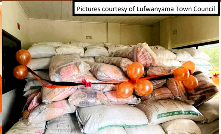
The Farming inputs ready for distribution.