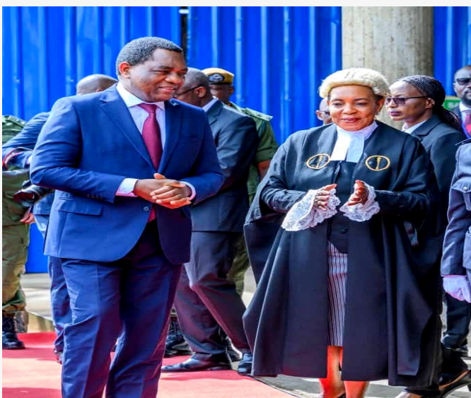
Speaker Mutti receives President Hakainde Hichilema at Parliament Buildings ahead of his address on National Values and Principles to the National Assembly.

“It is important to note that this fund is supporting our children and the people through bursaries, social cash transfer, skills development, healthcare services, water supply, market infrastructure and local economic activities,” President Hichilema said.