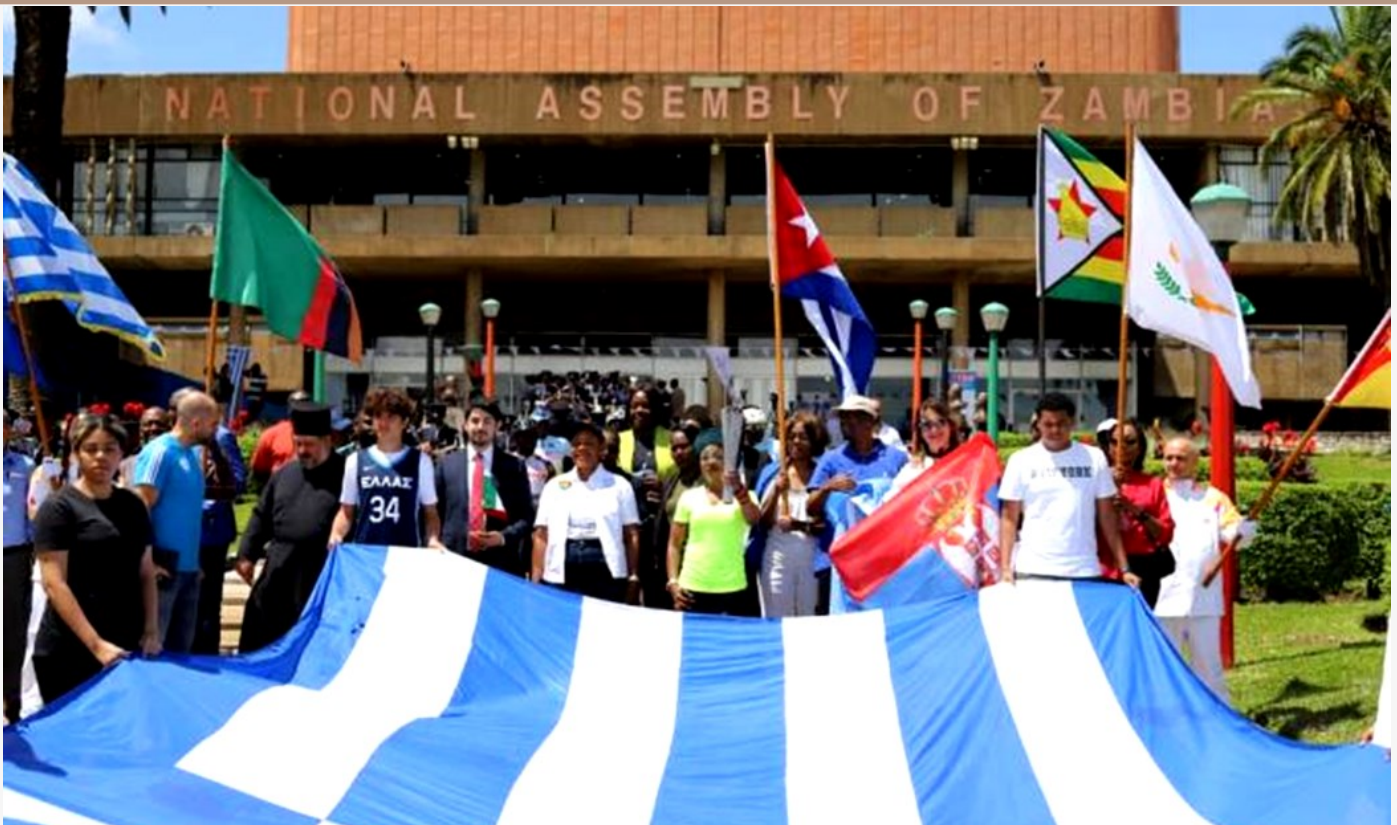
Speaker of the National Assembly, Hon. Dr. Nelly B.K Mutti, SC, MP, FAPRA (in white, in the center) posing for a picture with the participants of the Milano Cortina 2026 Winter Olympics.