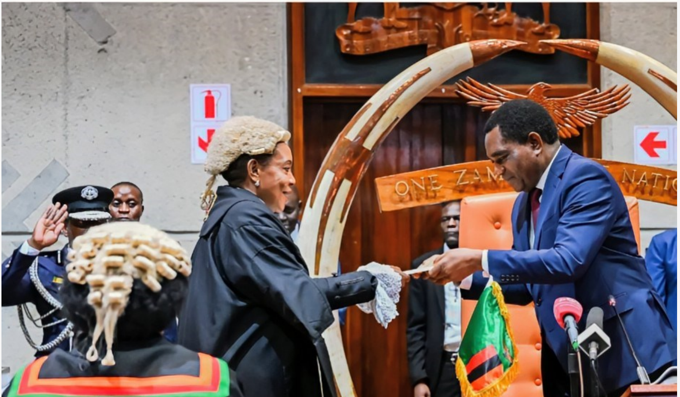
President Hakainde Hichilema hands over the speech on National Values and Principles to the Speaker of the National Assembly, Hon. Dr. Nelly B.K. Mutti, SC, MP, FAPRA, after his address to the National Assembly of Zambia.