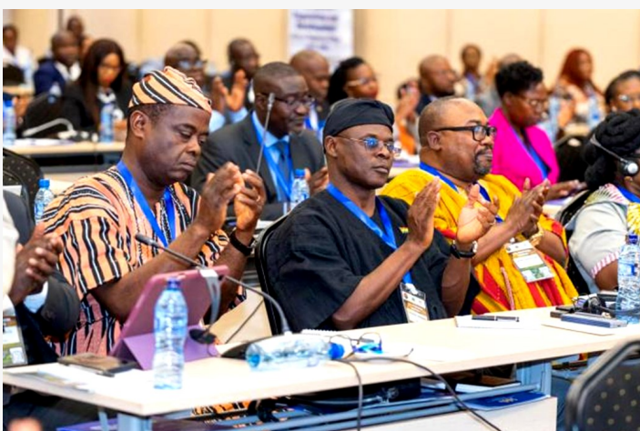
Delegates attending the NEOPACOH Forum