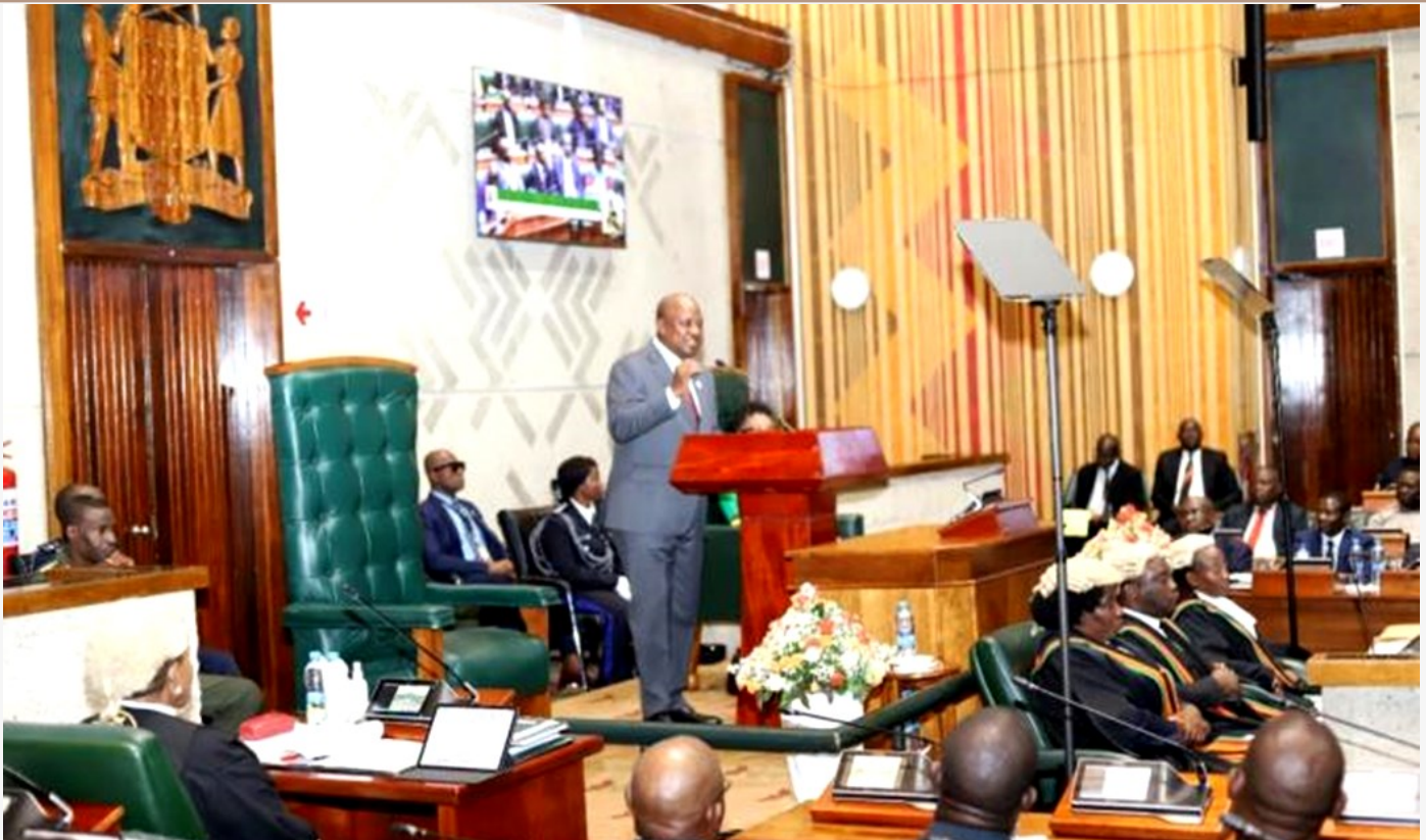
President John Dramani delivers his address to the National Assembly of Zambia.