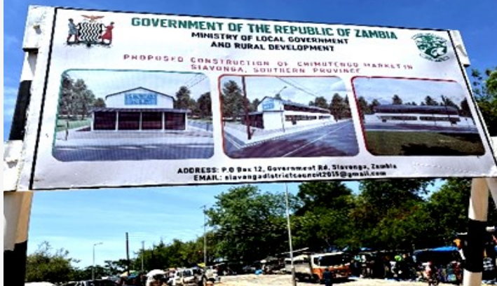
Sign post marking the site for the new market