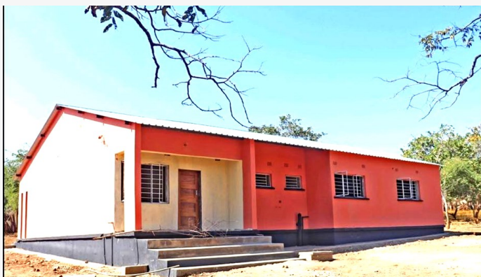
Newly constructed staff House at Mkale Health Post in Mkaika Constituency.