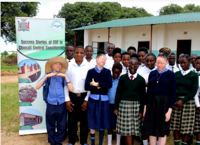
Beneficiaries of the CDF Secondary Boarding School Bursary Programme pose for a photo.