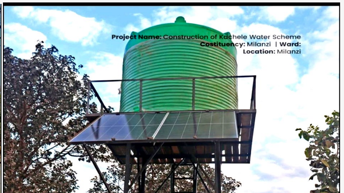
Set up of the Kanchele water scheme in Milanzi Constituency.