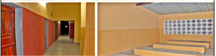
The newly constructed Clinic in Mkaika Constituency

the education sector, K16.6 million was invested in the procurement of more than 9,000 school desks, which are serving approximately 18,000 pupils across the district.