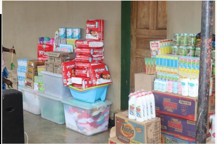
Some of the assorted items donated to the female inmates and their circumstantial children at Lusaka Central Correctional Centre (Chimbokaila).

She also commended Government for ongoing reforms, including the opening of new female correctional facilities in Mwembeshi and Livingstone, the launch of a mental health campaign and the establishment of the Zambia Correctional Service Women's Network, which addresses gender-based issues affecting both officers and inmates.