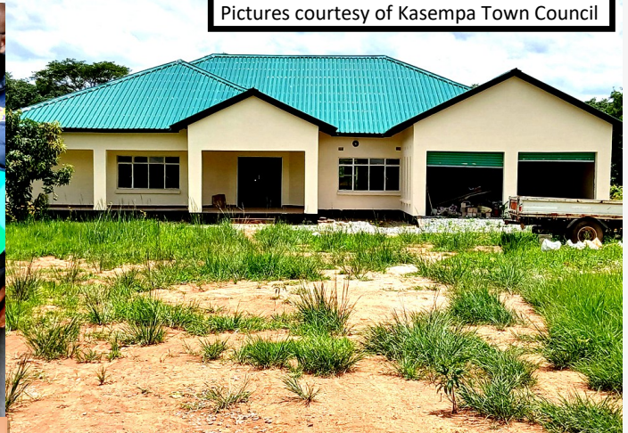
Chief Ingwe's palace which has reached about 90 percent completion.