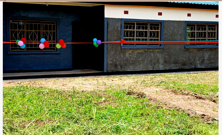
The solar-powered police staff house at Kankolonkolo, funded through CDF