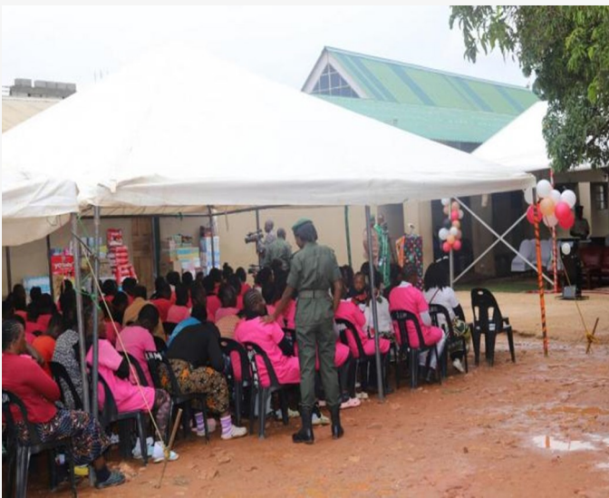
Female inmates and their circumstantial children seated in a tent at Chimbokaila during the donation.