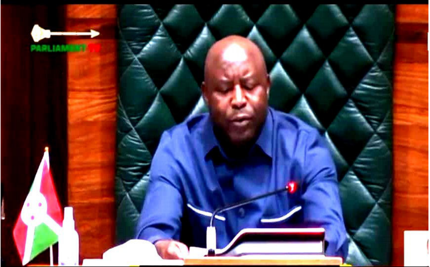
His Excellency, Mr. Evariste Ndayishimiye delivering a Special Address to the National Assembly of Zambia.