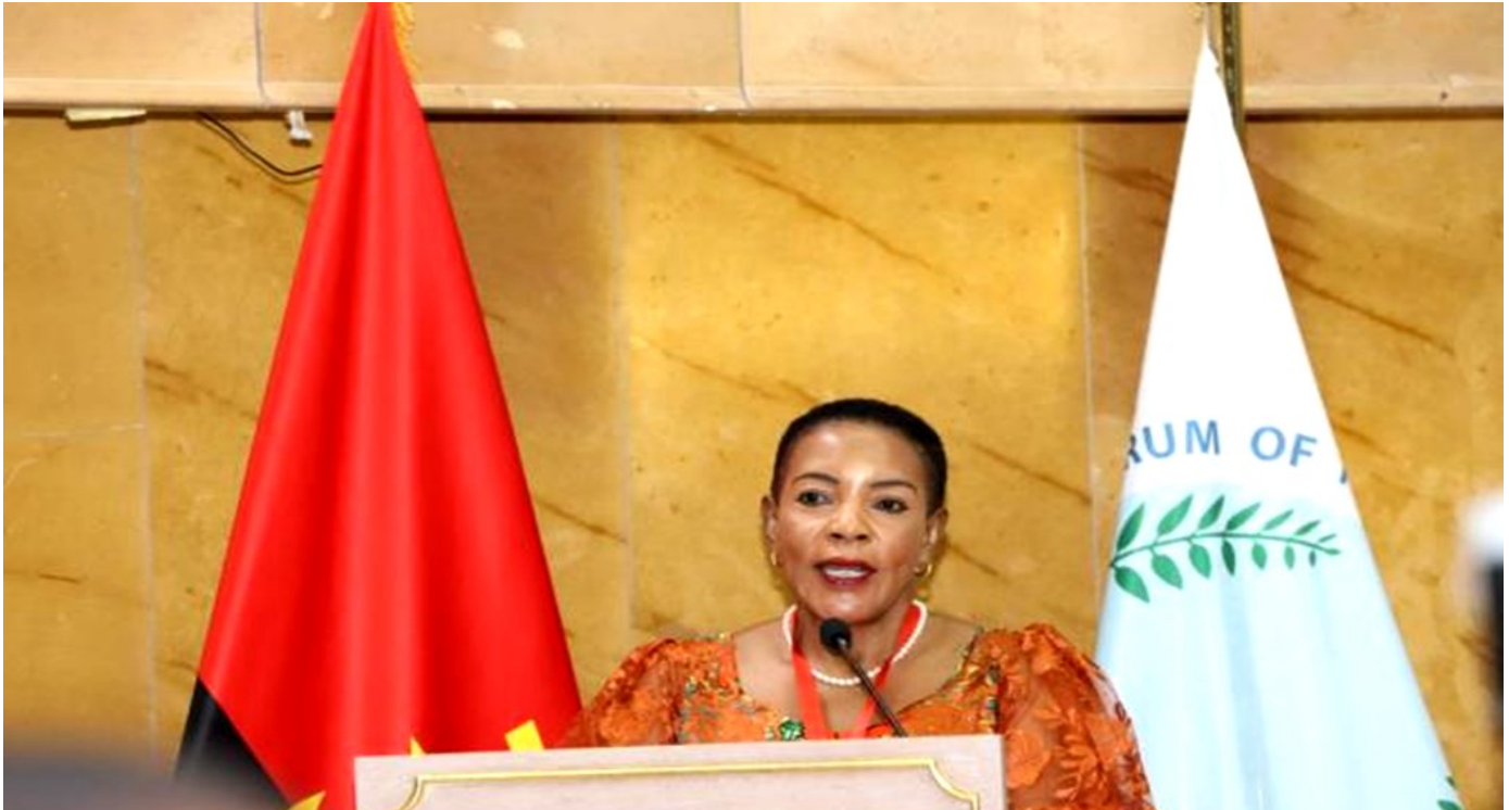
Speaker of the National Assembly of Zambia, Hon. Nelly B.K Mutti, SC, MP, FAPRA, delivers her final address as President of the FP-ICGLR during the closing session of the 15th Forum in Luanda, Angola