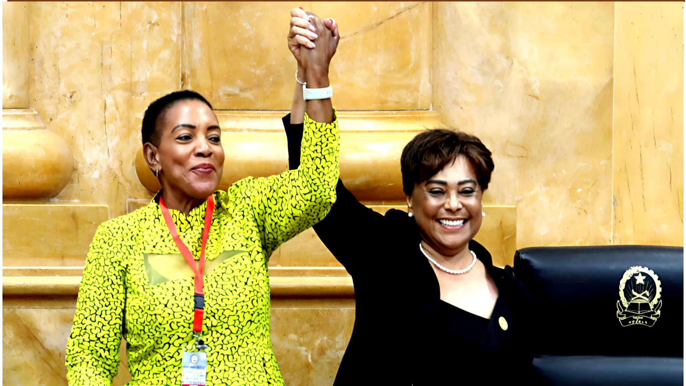
Speaker Nelly Mutti of Zambia (left) and newly elected FP-ICGLR President, Speaker Carolina Cerqueira of Angola, celebrate the symbolic handover of the Forum's leadership.