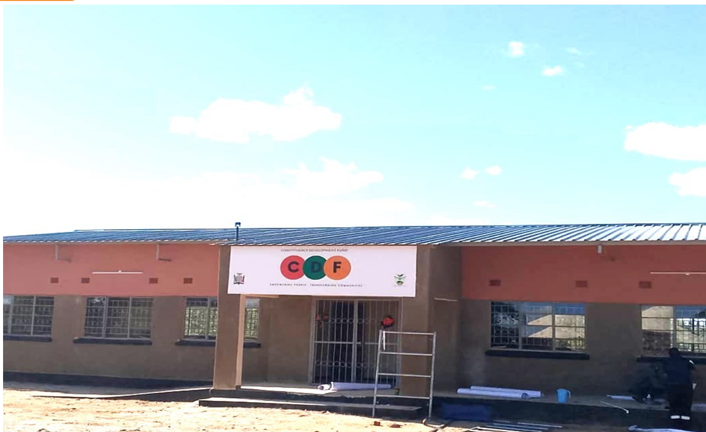
New 1x2 classroom block at Mainga Primary School in Luangeni Constituency built with 2024 CDF at a cost of K934, 927.17