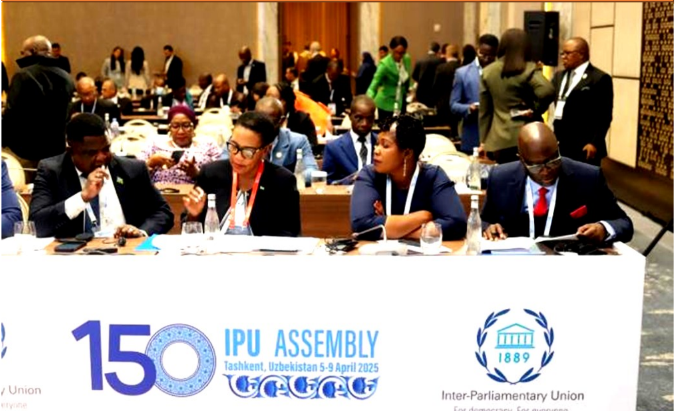
Speaker of the National Assembly, Rt. Hon. Nelly B.K Mutti, SC, MP, FAPRA (2nd left), with Zambia Parliamentarians at the 295 th Session of the IPU Executive Committee during the 150 th IPU Assembly and Related Meetings held in Tashkent, Uzbekistan