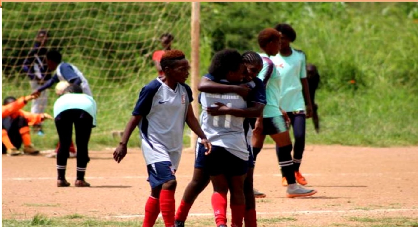
National Assembly Women's Football team players celebrate their hard fought promotion following their decisive Week 29 victory.