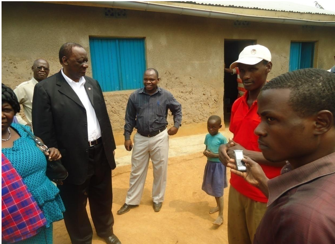
A Returnee Rwandese refugee in a white cap addressing Members of the Committee on National Security and Foreign Affairs at his home in Bugesera District, Eastern Province of Rwanda.