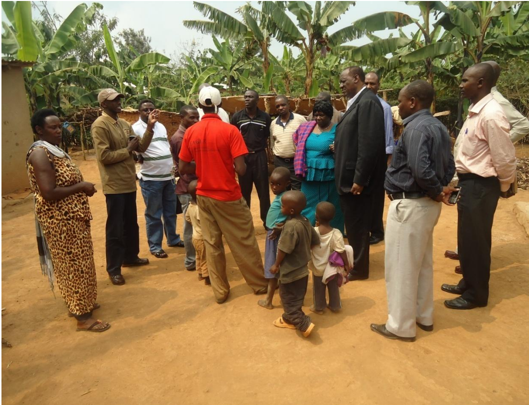
A Returnee Rwandese refugee from Tanzania in a white cap at his home in Bugesera District, Eastern Province of Rwanda emphasising a point on the importance of Rwandese refugees to return to their country.