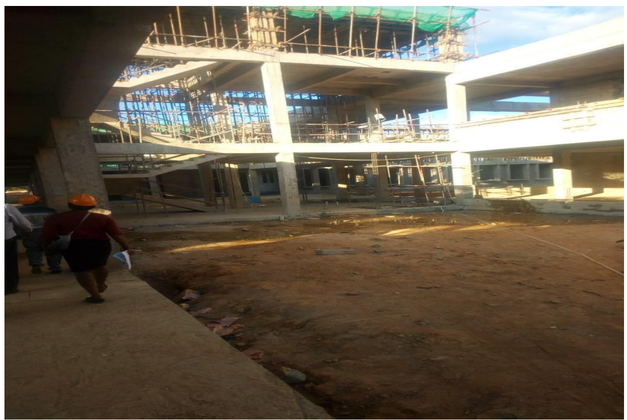
Part of the Chinsali General Hospital toured by your Committee