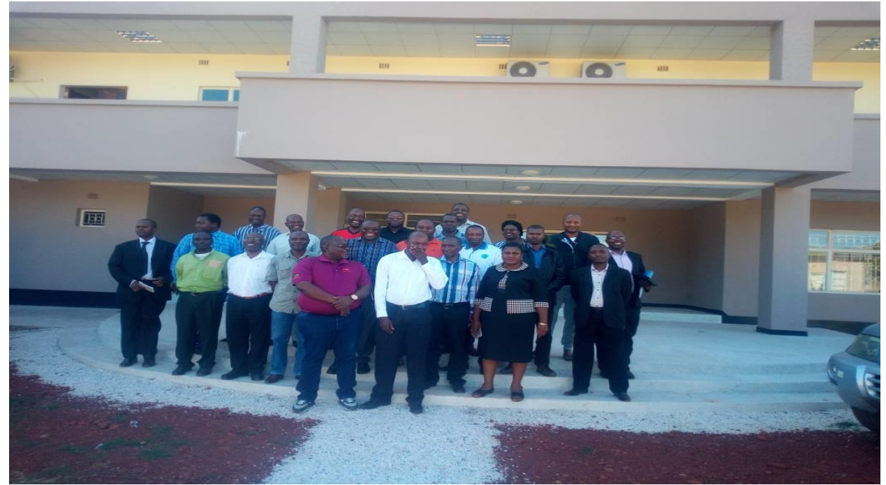
Members of your Committee and officers from the Northern Provincial Administration pose for a photo in front of the finished Kasama Laboratory Building.

Further, the Laboratory shall host four major specialised laboratories as outlined below: