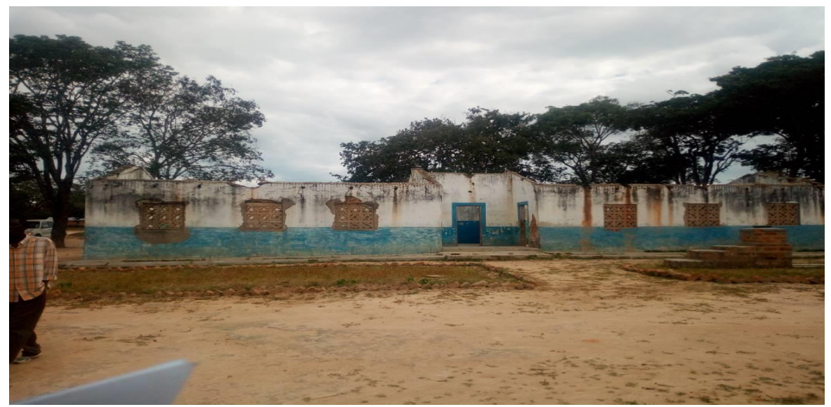
Current state of a 1X2 classroom block at Mateyo Kakumbi Primary school with blown off roof.

Apart from the deplorable state of the class room block, the school had inadequate classrooms, no classrooms for pre-school and inadequate staff accommodation. Enrolment levels were also very low due to long distances which the children were required to cover for them to get to the school.